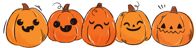
designed by freepik