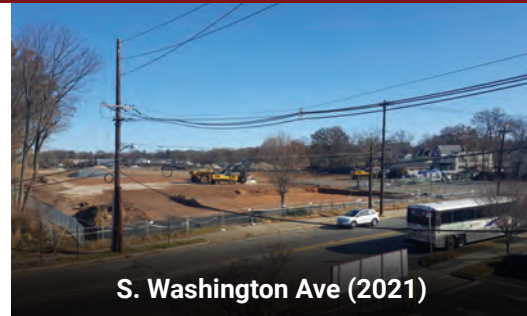
S. Washington Ave (2021)