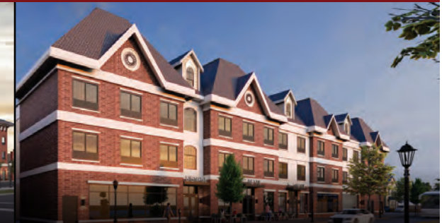
North Hamilton Project - 405 North Avenue

This new mixed use apartment will have 62 residential units with ground level retail and commercial space, and parking to allow new businesses and residents to call our Miracle Mile home. This project was approved by the Dunellen Planning Board at the September 23, 2024 meeting and will be replacing underutilized and underdeveloped property in our downtown.