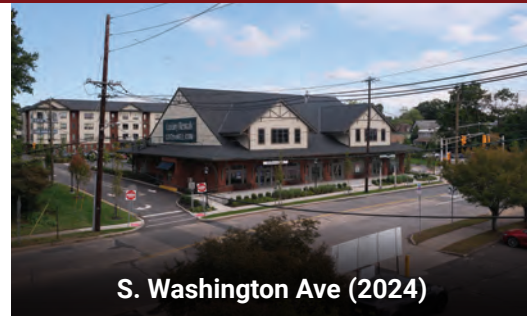
S. Washington Ave (2024)