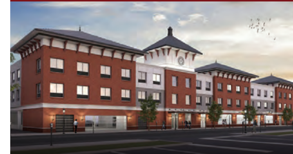
431-441 North Avenue - Mixed Use Apartment

This new mixed use apartment will have 62 residential units with ground level retail and commercial space, and parking to allow new businesses and residents to call our Miracle Mile home. This project was approved by the Dunellen Planning Board at the September 23, 2024 meeting and will be replacing underutilized and underdeveloped property in our downtown.