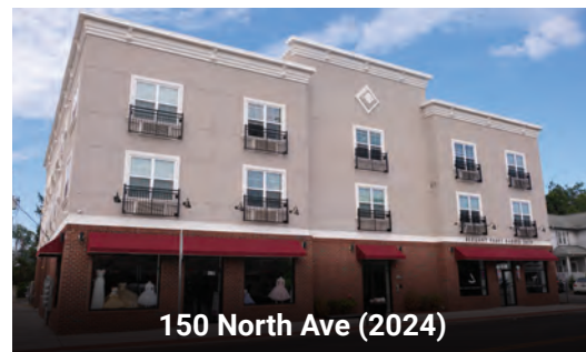
150 North Ave (2024)